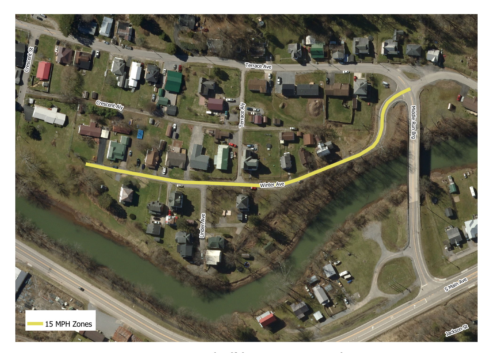
Map Identifying 15 MPH Zone on Winter Avenue